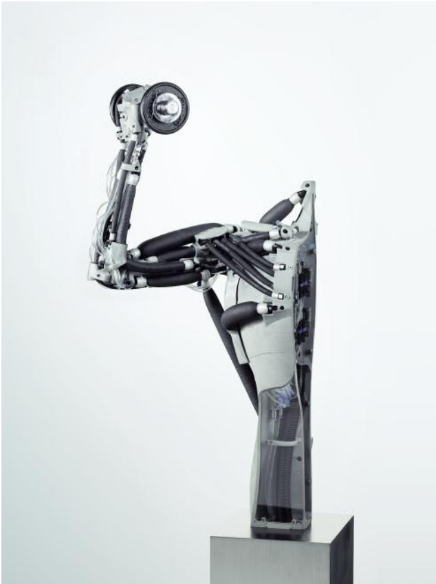
Airc's_arm with artificial bones and muscles