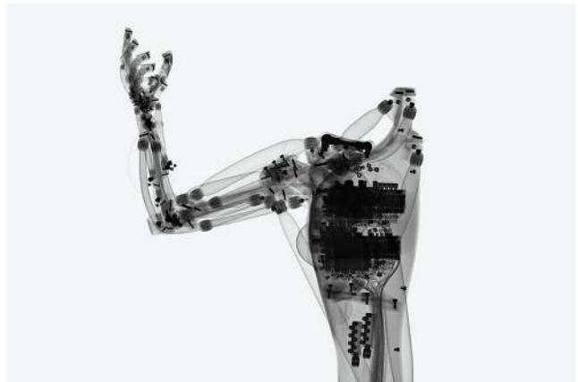
X-ray images of Airic's_arm

How can technology be used to contrive a movement device which comes as close as possible to the human model in terms of overall concept, technical design and bionics Airic's_arm was inspired by nature. Its combination of mechatronics and bionics opens up new opportunities for shaping the future of automated movement.