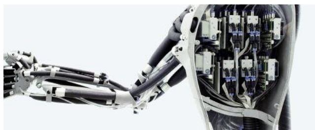
Piezo proportional valves

With this technology, the forces applied and the muscle's rigidity can be precisely metered. This is effected with very small, highly innovative proportional valves from Festo based on piezo technology. It was only the compact design that made it possible to position the 72 proportional valves, together with the pressure sensors and the power electronics in the form of 8 valve modules, close to the muscles; this was a prerequisite for reliable muscle control. The tensile forces and the contraction of the individual muscles are measured by pressure and length sensors. A mechatronic unit developed by Festo then regulates the pressure distribution within the system, allowing movements that closely approach the action of human muscles in terms of kinematics, rapidity, force, but also refinement.