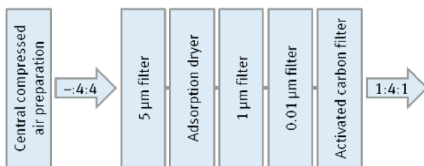
Filter cascade for compliance with class 1:2:1

The compressed air is used for transporting and mixing, as well as for food production in general. It comes into direct contact with the food. Because these foods are dry, even stricter requirements apply with regard to atmospheric humidity. Consequently, the following classification in accordance with ISO 8573-1:2010 is recommended in this case: Solid particles: class 1 Water: class 2 Oil: class 1